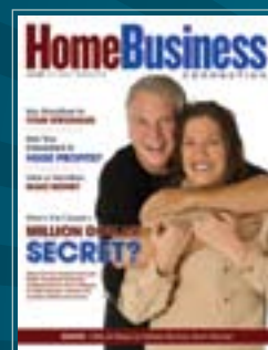
Home Business Connection

Home Business Connection. Your company's message in front of 250,000 potential distributors every month. HBC is our best-known magazine, and the perfect way to attract new prospects from all over the country.