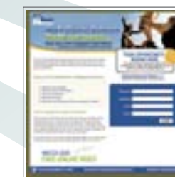
Custom Ad Page