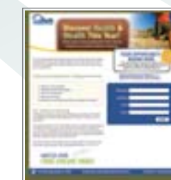
Custom Ad Page